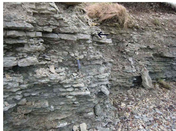
Fig. 3. Ohesaare cliff. The arrow points to beds with Cruziana .

Formation includes Proetus conpersus , Calymene blumenbachii , C. conspicula , C. laevigata , C. soervensis and Acaste dayiana (Kaljo 1970; Hints et al. 2008). The