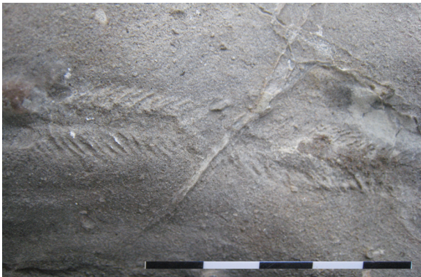
Fig. 4. Cruziana isp., Pridoli, Ohesaare Formation, Saaremaa. Scale bar division = 1 cm. TUG 1670-1.

records of two types (A and B) of Cruziana traces from the Late Silurian of Norway (Davies et al. 2006). Both of these traces differ from Cruziana isp. of the Ohesaare Formation, indicating that the diversity of Cruziana traces in the Late Silurian of Baltica was higher than previously known.