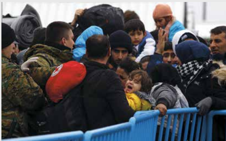
Refugees on Macedonian-Greek border trying to get on a train to Serbia

A massive increase of migrants heading to Europe in 2015 has resulted in escalated economic, social and political pressure, and security threats in EU member states. This holds true for both southern European countries at the frontline of the influx of migrants, as well as for northern Europe, which is an increasingly popular destination for migrants. European countries have a limited capacity and appetite to receive the increasing number of migrants, and more and more refugees are using illegal methods for entering the European Union. The number of people who have tried to enter the EU using false identification or have presented false information about their nationality also increased markedly in 2015. As the migratory movement intensifies, identification of people and checking identity requires more time and more resources.