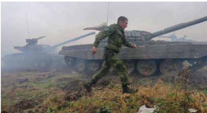
A separatist fighting in Donetsk

Russian aggression poses a particular threat to the countries over which Russia is trying to prevail in order to restore its position as a global authority. Russia's foreign policy is based on the notion that all parts of the former Soviet Union (e.g. the CIS) belong to its sphere of influence. Thus, Russia considers itself a political and military guarantor that is responsible for stability