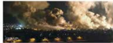
as "Western nations a people to have died" (reported by Reuters) and also showed from the "blood and the like" way of the attacks will become evident (20 October 19).