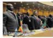
France, Oman, Romania, Poland, Portugal, Qatar, Republic of Korea (South Korea), Romania, Saudi Arabia, Serbia, Singapore, Slovakia, Slovenia, South Africa, Sweden, Switzerland, Taiwan, Thailand, United Arab Emirates, United Kingdom, and United States.

Other regions and states included by the West but not mentioned above include: the West and the Islamic State in some states: Algeria, the African Union, Bahrain, Cameroon, Chad, Egypt, and Nigeria are all included in the war against "Islamic State" in Algeria, Afghanistan, Albania, Algeria, Armenia, Azerbaijan, Bangladesh, Bahrain, Belgium, Bosnia and Herzegovina, Bulgaria, Canada, Czechia, Cyprus, Czech Republic, Denmark, Egypt, France, Germany, Greece, Hungary, India, Israel, Italy, Japan, Jordan, Kazakhstan, Kuwait, Latvia, Lithuania, Luxembourg, Macedonia, Maldives, Malawi, Malaysia, Maldives, Mauritius, Mexico, The Netherlands, New Zealand,