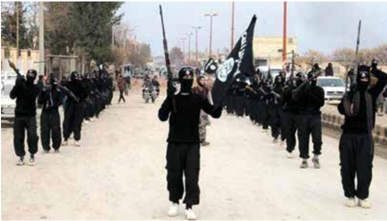
Daesh combatants marching into Raqqa, Syria