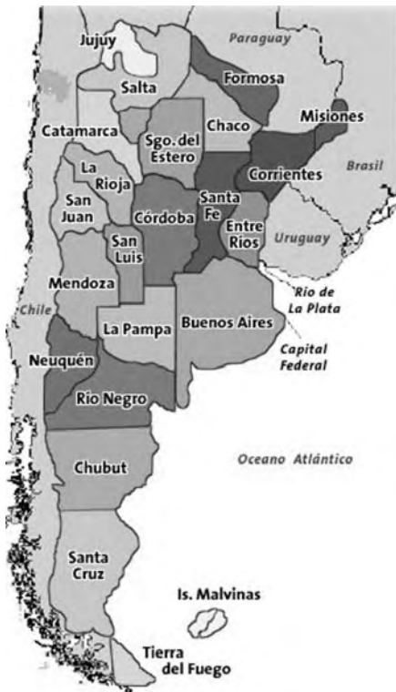
Provinces of Argentina.

and Agüero Vera. Furthermore, as I will try to show in the following, these new archives indicate a shift towards a paradigm of folklore based on studies of regional contextual variation, as well as towards research reflecting on the process of constructing narrative messages (Jakobson 1964) as well as on channels and codes of circulation of the narrative material.