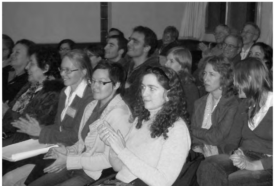
Closing ceremony of the conference in the University of La Pampa.

The reason I chose this topic is because international frontiers are sensitized regions where two political systems and two cultures come face to face. Borders usually provide a valuable resource for a better understanding of the effects from which socio-cultural identities arise within folk groups, those groups that produce, perceive, perform, recognize or value a particular behaviour that we call folklore. Intercultural communication is much more frequent on borders than in other areas, and the in-group as well as the out-group often strengthen identity-features, local pride, conflicts and nationalistic reactions. Besides, people living at the border use stereotypes to describe their neighbours on