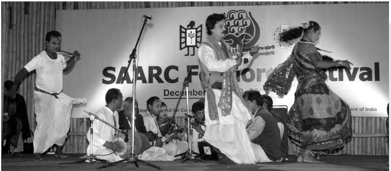
Folk artists from Rajarhat, Kurdigram, Bangladesh who continue the indigenous art form Kushan Gaan, presenting scenes from Ramayana.