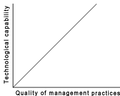
Fig. 2. Hypothetical relationship between quality of management practices and technological capability.

Prior studies in Estonia [6] have suggested a positive correlation between company size and the quality of management practices (defined in the frame of strategic planning). Such studies have alleged that smaller companies in Estonia tend to limit their horizon of planning with maximum of one year, while larger companies plan for 4 to 5 years. However, the same studies would state that the larger companies in the industry sector studied were foreign owned [6]. Next, it is argued that the foreign companies (such as subsidiaries of foreign corporations) were more likely to apply holistic enterprise management systems in order to achieve their goals more efficiently [6].