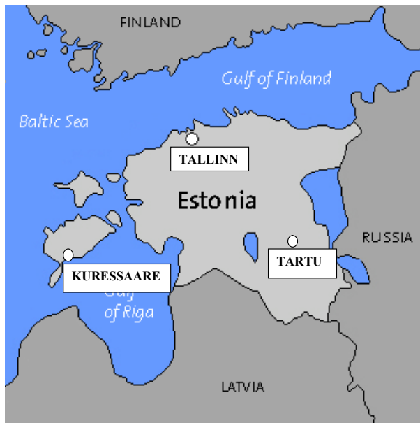
Fig. 1. Forecast and measurement sites in Estonia.

temperature measurements were carried out by means of the automatic weather stations.