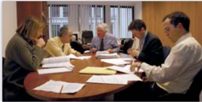
Parts of the policy team finalising work on a legislative opinion.

EDPS underlined that the introduction and processing of biometric data need to be supported by particularly consistent and strong safeguards. Biometric data are highly sensitive and present special risks in their implementation which have to be mitigated. In view of their specific characteristics, the EDPS reiterated the importance of surrounding the processing of biometric data with all the necessary safeguards. An obligation to use biometric data should only be introduced after a thorough assessment of the risks and should follow a procedure allowing full democratic control. This approach, developed in the opinion on the proposals regarding the second generation Schengen Information System (SIS II), should be applicable to any system using biometrics, whether it relates to proposals on residence permits, Community laissez-passer or visas for diplomatic missions.