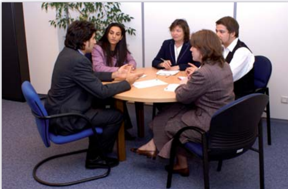
Parts of the human resources team discussing a dossier.

In its report on the financial year 2005, the Court of Auditors stated that the audit had not given rise to any observations.