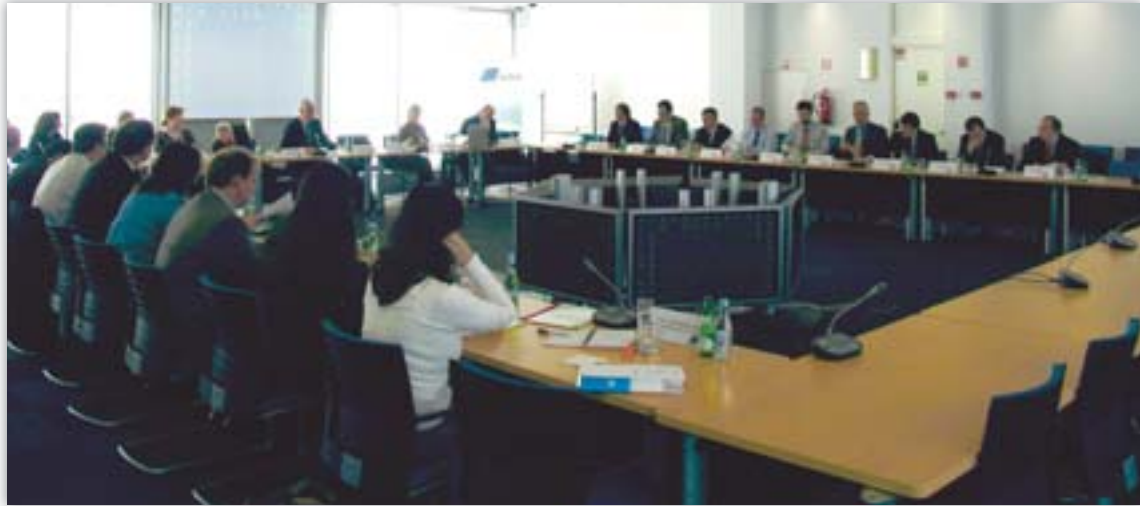
EDPS attending a meeting of the DPO network in Lisbon, Portugal.

This informal network has proved productive in terms of collaboration. This has continued during 2006.