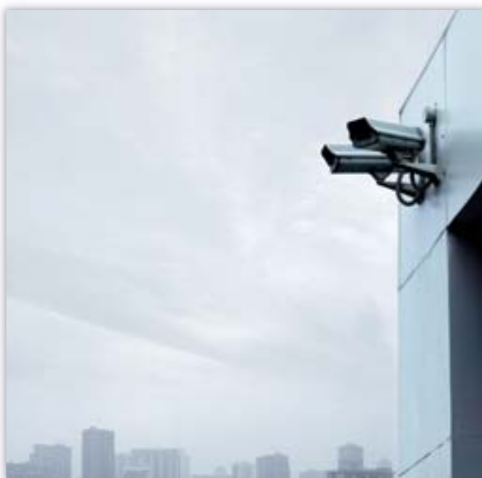
The number of surveillance cameras has increased during recent years.

decision, concluded that the temporary limitation, while the report was not final, was lawful, but advised that access should be granted to the final report in the usual manner as to other reports of the same kind and that the access to the interim report should be reconsidered in view of the final report. The second aspect was the transfer of medical data to an insurance company without the consent of the complainant. The conclusion was that the transfer was necessary and non-excessive in the context of the duties of the EC administration to insure the financial consequences