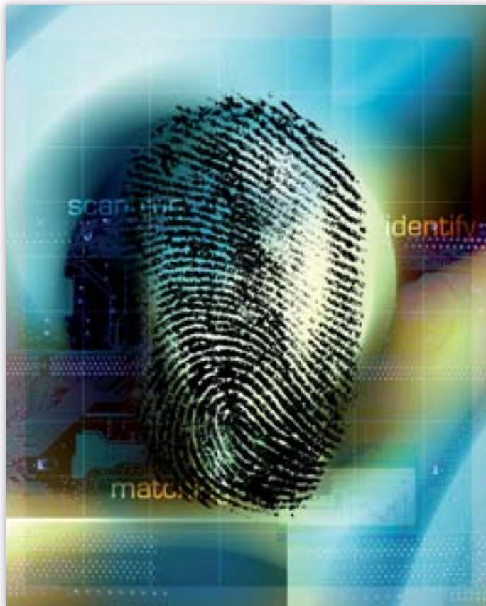
The Eurodac system contains more than 250.000 fingerprints.

In view of these responsibilities, regular meetings and informal contacts between the EDPS and Commission services have taken place to discuss different aspects of EDPS' supervisory tasks. These contacts concerned in particular the inspection of Eurodac carried out by the EDPS and the concerns about the high number of 'special searches' performed in the system (30) .