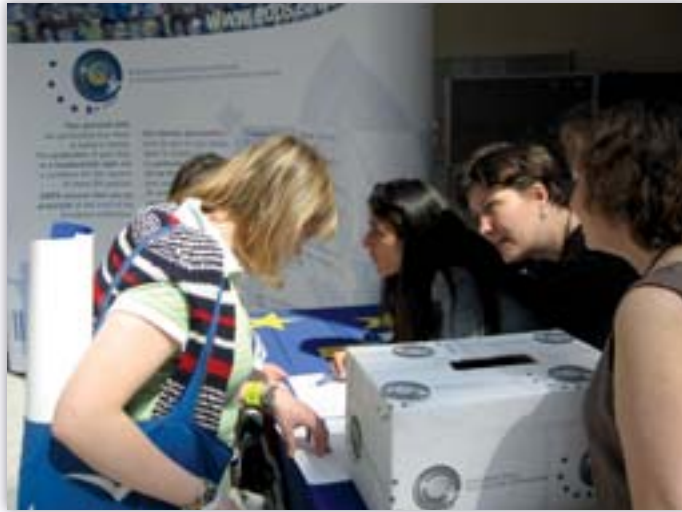
EDPS staff manning the stand inside the European Parliament during the Open Day on 6 May 2006.

A stand and some smaller promotional material (pens, post-its and USB-sticks) were developed for use during the Open Day as well as for other occasions. The EDPS stand was put up inside the European Parliament and more than 200 people took part in a quiz on data protection issues, which inspired discussions about privacy and data protection in Europe.