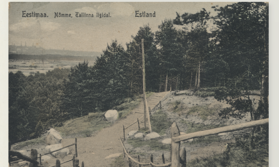
Nõmme liivik La sabbia a Nõmme The sands in Nõmme