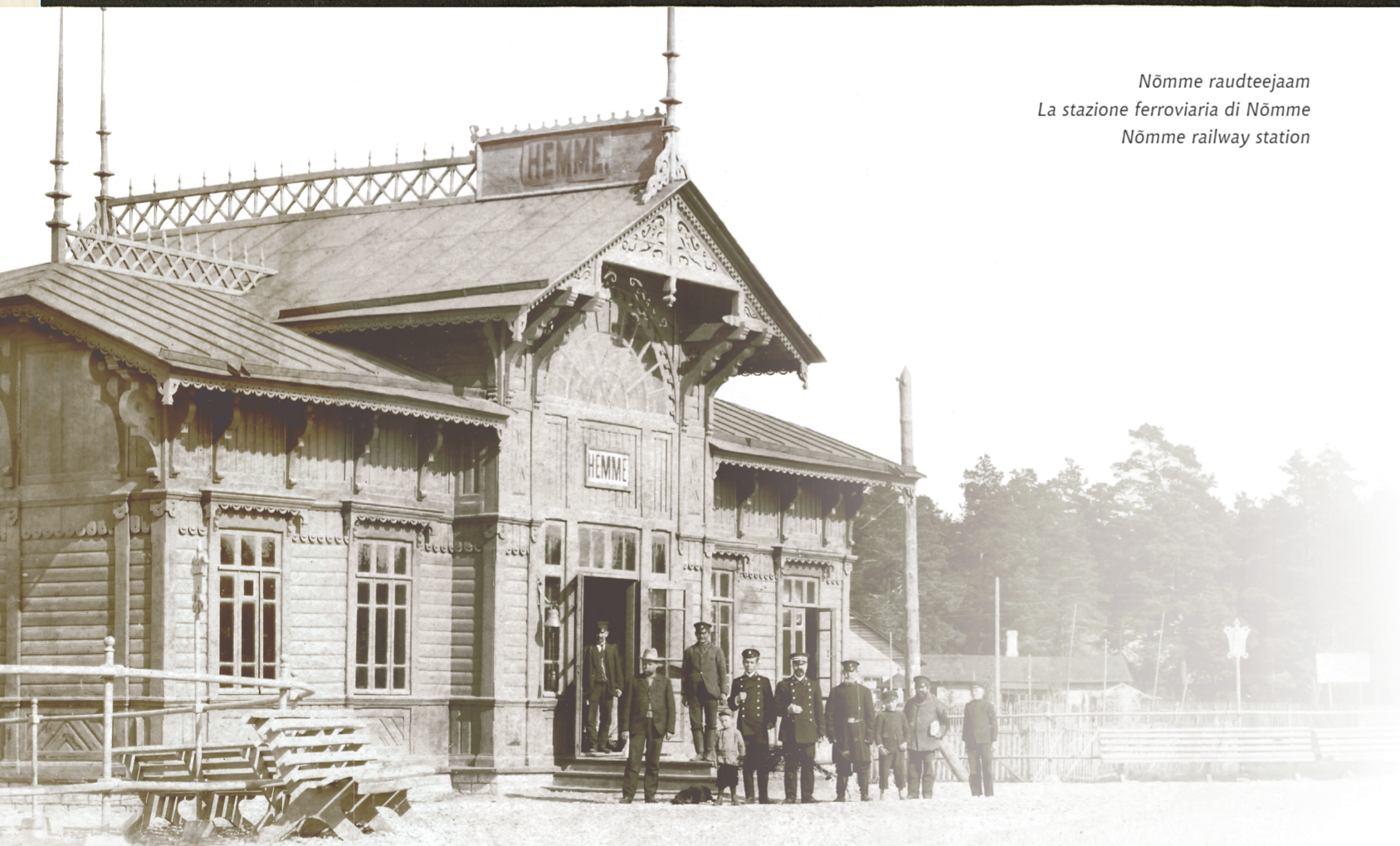
Nõmme raudteejaam La stazione ferroviaria di Nõmme Nõmme railway station