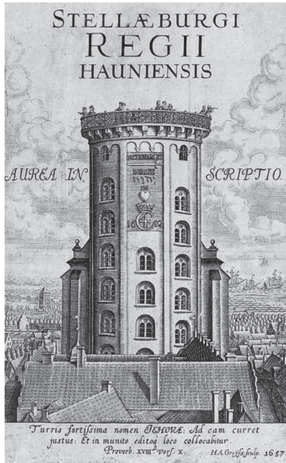
Figure 2. The Round Tower in Copenhagen with its observatory platform.

the heavens that would surpass even those uncovered by Galileo, he was sceptical with regard to its use in astronomy: “This optical apparatus [...] has not, according to my judgment, been very important with respect to the progress in astronomy. For astronomy does not so much investigate the heavenly bodies themselves and their casual properties as [it investigates] their motions and definite periods; it hands over the peculiarities of the stars to physics, which treats them by means of optics.” That is, even though Longomontanus admitted that the telescope offered some advantages, he did not consider it essential for astronomical purposes. It was of little use for positional astronomy and, moreover, would not help determine whether the Copernican or the Tychoenic world system was the right one.