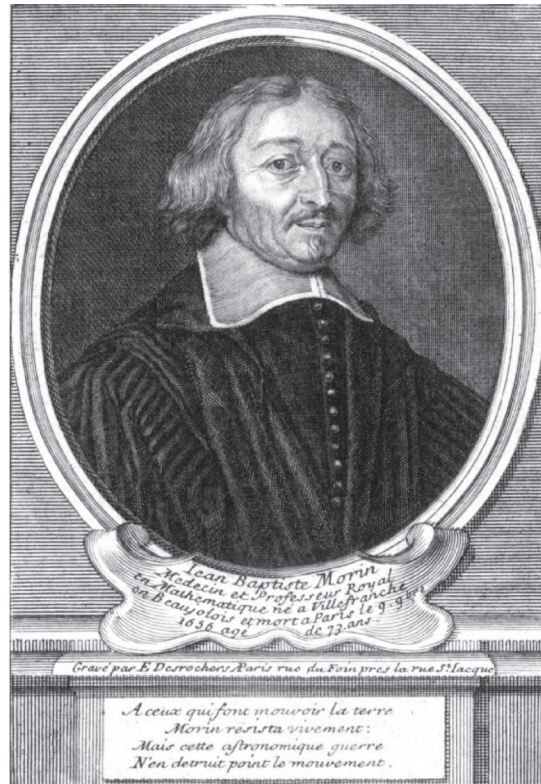
Figure 4. Jean Baptiste Morin (1583–1656). Plate by Étienne Desrochers.

Longomontanus seems to have valued Morin as an astronomer and mathematician, and in the 1630s the two exchanged several letters. Frommius too admired Morin, whom he wished to meet during his journey in the Netherlands. Armed with a letter of recommendation from Longomontanus he planned to go to Paris to discuss Morin's theory of the longitude with him, but it is uncertain if the two