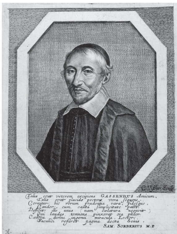
Figure 5. Pierre Gassendi (1592–1655). Plate by Cornelis Visscher.