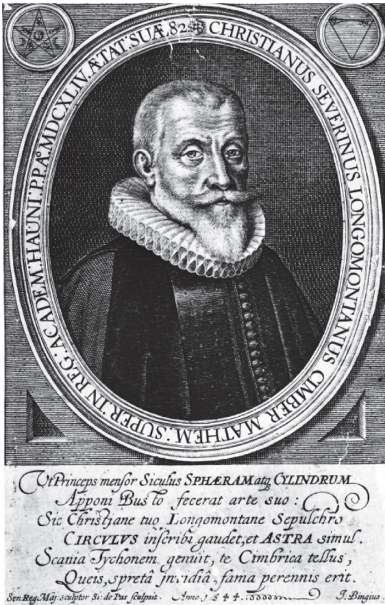
Figure 1. Longomontanus (1562–1647). Plate by Simon de Pas, 1644.

performed a daily rotation rather than the heavens rotated round the immobile Earth. On the other hand, he continued to reject the decisive element in the Copernican theory, namely the idea that the Earth was a planet travelling in a circular orbit around the Sun. Longomontanus was not the only of Tycho's former assistants who accepted the "Tycho-Copernican" notion of a rotating Earth. Norwegian-born Cort Aslaksen, who had worked with Tycho in 1590–1593, did the same in De natura caeli triplicius , published in 1597. The work was in the tradition of so-called Mosaic physics aiming at reconciling the Old Testament and scientific astronomy, of which he was an ardent advocate (Moesgaard, 1977; Blair, 2000). Like Longomontanus, Aslaksen became a professor at Copenhagen University, first in pedagogy and Greek and since 1607 in theology.